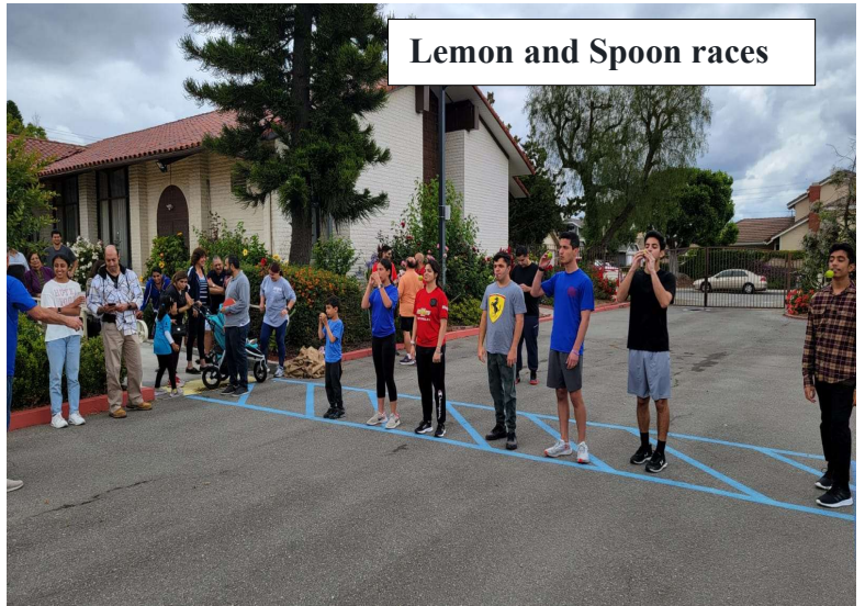
Lemon and Spoon races