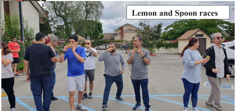
Lemon and Spoon races