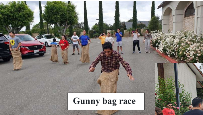
Gunny bag race