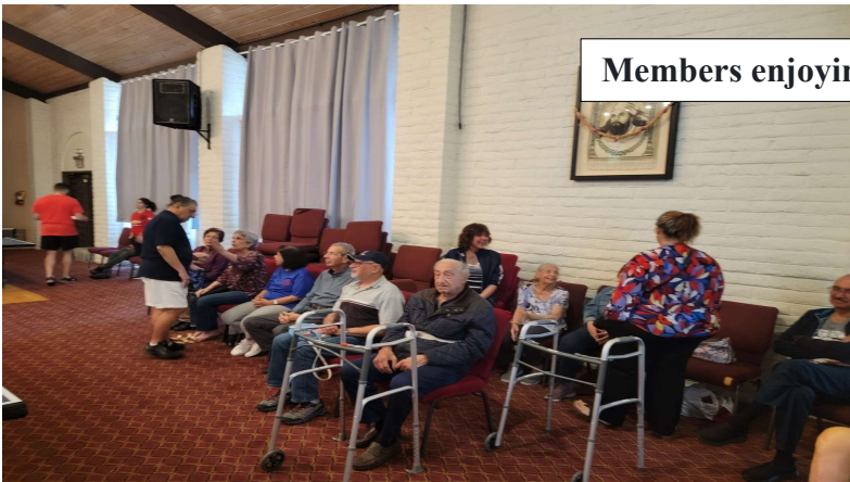
Members enjoying the moment