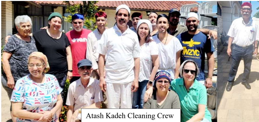
Atash Kadeh Cleaning Crew

To the hardworking, dedicated team of 16 volunteers who sacrificed their Saturday, to clean the Atash Kadeh for 6 hours, making sure everything is sparkling and ready for the muktad prayers.